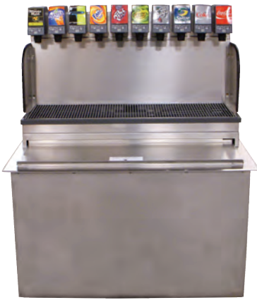
Note: Picture shown with optional splash guards

The ICD 3023 is designed using the highest quality materials and state-of-the-art technology providing our customers with consistent drink quality.