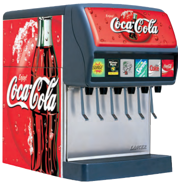
Shrouded cabinet with optional lighted marquee