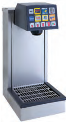
Beverage Dispenser Model

Lancer's new Flavor Craze Tower is an ideal way to offer customers a flavor shot capable dispenser in a very small footprint. Designed to accompany the Lancer IBD line, the Flavor Craze Tower is made with the highest quality materials and state-of-the-art technology and provides a unique drink experience.