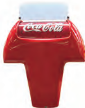
Double Red Head Tower