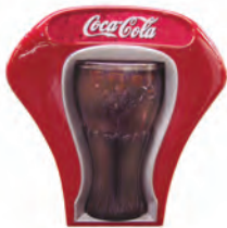
Bubbling Glass Tower