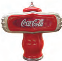
New Ceramic Tower

The Convertible Tower is designed using the highest quality materials and state-of-the-art technology providing our customers with consistent drink quality.