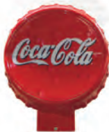
Maxi Crown Tower